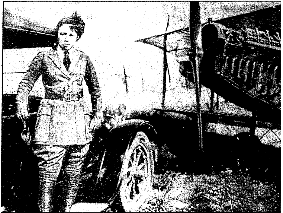
Coleman, in uniform, stands on the runner of a Model T Ford. The nose and right wing of her plane are to her left.

Bessie Coleman was born on January 26, 1892. She was a bright girl and a star pupil in school. In Waxahachie, Texas, where Bessie grew up, black children and white children 13 attended different schools. Each year Bessie's school closed for months at a time. Instead of studying, the children joined their parents picking cotton on big plantations. Bessie's mother was proud of her daughter's sharp mind. She didn't want Bessie to spend her life picking cotton, and urged her to do something special with her life.