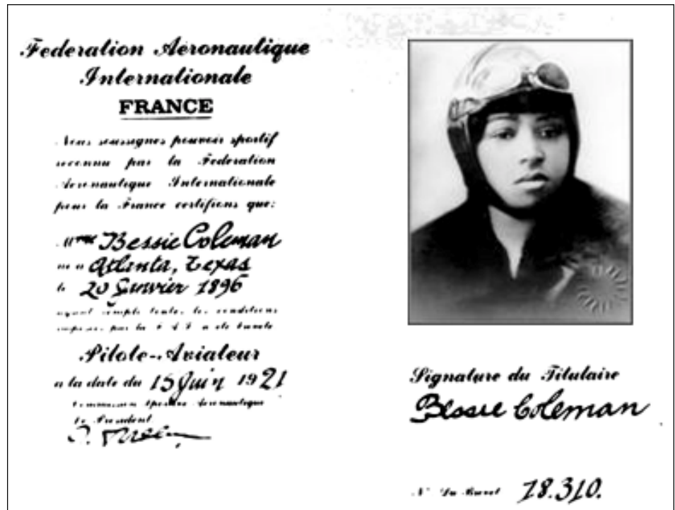
Coleman's pilot license was issued on June 15, 1921, in France. The year of her birth is incorrect. Bessie Coleman was born in 1892, not 1896.

Many people, both black and white, were very impressed by Coleman's determination. A white businessman helped her buy another plane. By 1926, Coleman was back where she had been before the crash. She wrote to her sister, "I am right on the threshold of opening a school."